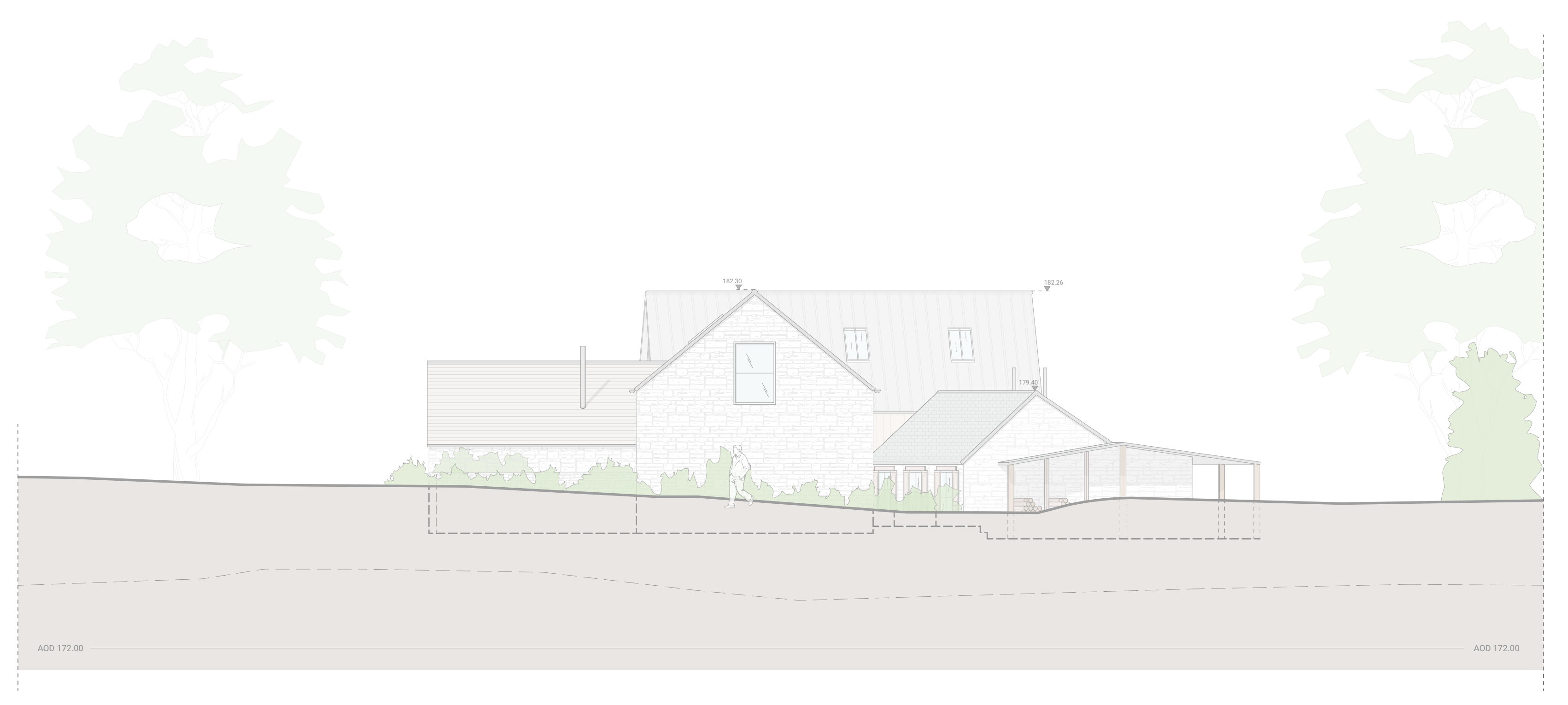
PREVIOUSLY SUBMITTED SOUTH ELEVATION D